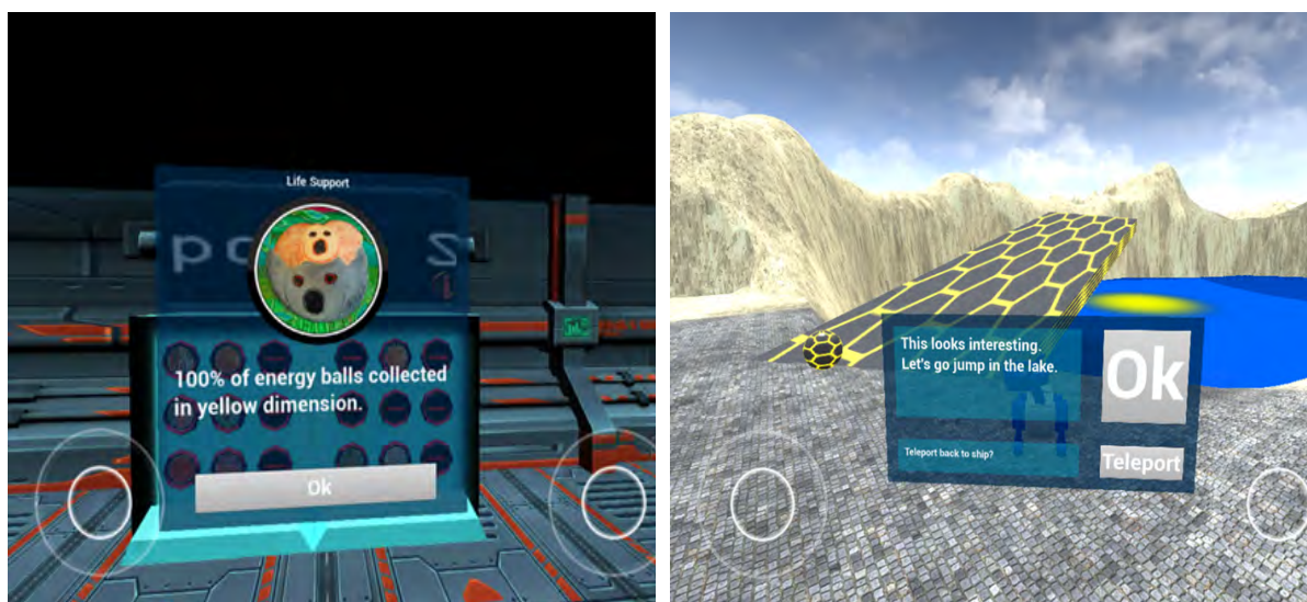
Figure 2: Screenshots of the interior of spaceship with its life support system panel with a collectable pop-up (left) and the yellow dimension with a diving board to access a floating platform with the literacy exercises (right).

Robo WordQuest is based on a science fiction scenario, a preferred genre amongst undergraduate students we spoke to as in the focus groups we held as part of the design process. The narrative is that a spaceship has crashed on an alien planet. The player, in first-person view with their friend (a non-player character robot dog), must explore different dimensions of the planet so that they can gather 'energy cell' collectables that can repair the ship. From a design perspective, the game has three zones: (1) the spaceship which the player can teleport to and from and which houses the energy and life support systems that populate with energy cell collectables as the player completes literacy exercises, exploration and item collection side missions; (2) a planet with three different coloured dimensions (blue, green and yellow) which consists of hills, lakes and ravines to be freely explored; and, (3) floating platforms within the dimensions which comprise training videos and literacy mini-games that can be accessed by jumping off diving boards that propel the play upward (see Figures 2). Player monitor their progress through the display of energy cell collectables on achievement boards, represented in game as the energy and life system panels. The game was developed using the Unreal Engine 4.