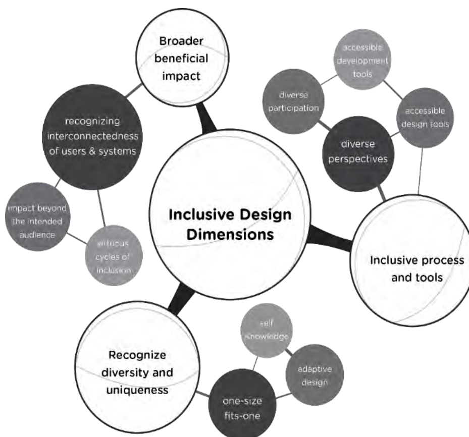
Figure 1: Dimensions of inclusive design (Inclusive Design Research Centre, n.d).