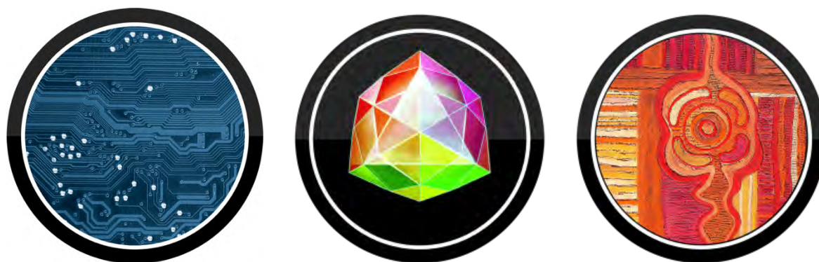
Figure 4: Example collectable energy cells: circuit (left), gem (middle), and Aboriginal design for koyiyoong or campsite (right).

Upon completing all the literacy mini-games on each platform and after side-missions, the player is offered a choice of three collectable energy cells which plug into the ship's broken energy and life support panels (see Figure 4). Game customisation was highlighted as desirable in the student focus groups. In Robo WordQuest the player gets to customise the look of the life support system panel by selecting energy cell design of choice. A third of the energy cell collectables are designs from Aboriginal artist Saretta Fielding featuring Australian fauna and Aboriginal designs (Figure 4 right).